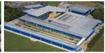
Hörmann KG Brockhagen, Germany