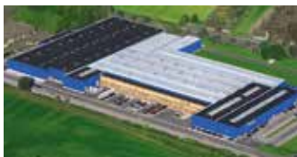
Hörmann KG Werne, Germany