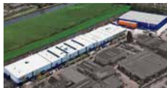
Hörmann Alkmaar B.V., Netherlands