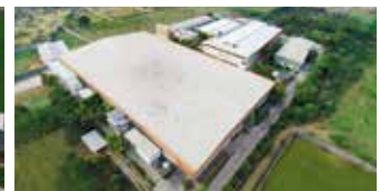
Shakti Hörmann Pvt. Ltd., India

Hörmann is the only manufacturer worldwide that offers you a complete range of all major building products from one source. We manufacture in highly-specialised factories using the latest production technologies. The close-meshed network of sales and service companies throughout Europe, and activities in the USA and Asia, make Hörmann your strong partner for first-class building products, offering "Quality without Compromise".