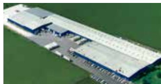
Hörmann LLC, Montgomery IL, USA