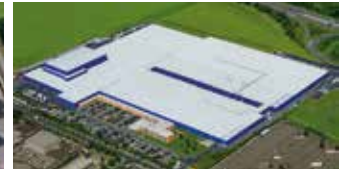
Hörmann KG Ichttershausen, Germany