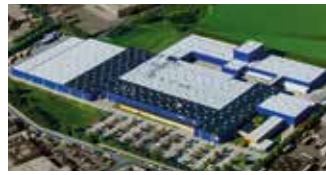
Hörmann KG Brandis, Germany