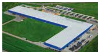
Hörmann Legnica Sp. z o.o., Poland