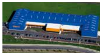
Hörmann Flexon LLC, Burgettstown PA, USA