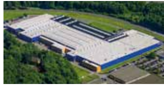
Hörmann KG Eckelhausen, Germany