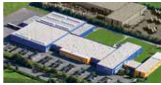
Hörmann KG Antriebstechnik, Germany