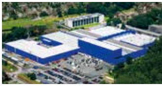
Hörmann KG Amshausen, Germany