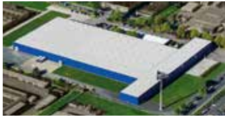
Hörmann KG Dissen, Germany