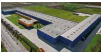
Hörmann Tianjin, China