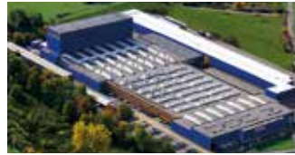
Hörmann KG Freisen, Germany