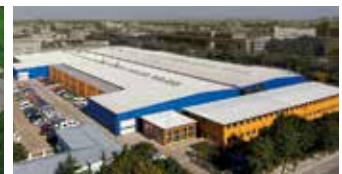
Hörmann Beijing, China