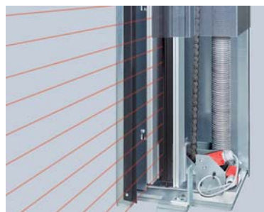
Non-contact automatic safety cut-out thanks to a standard safety light grille.