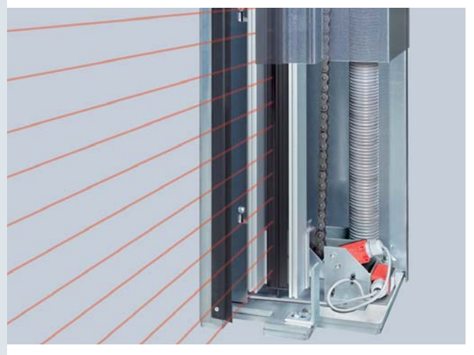
The integrated light grille increases the door's safety.