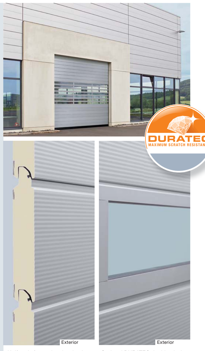
Uniformly foamed, galvanized steel sections, Micrograin surface finish on exterior, Stucco-textured on interior.

For 25 m<sup>2</sup> door size U_D = 1.95 \text{ W/(m}^2\text{K)}