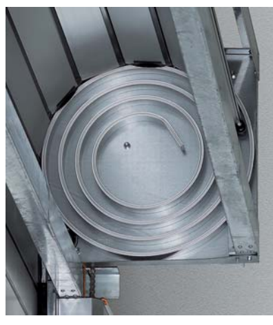
The non-contact roll-up technology pulls the sections into the spiral bracket at a high speed and without any wear.