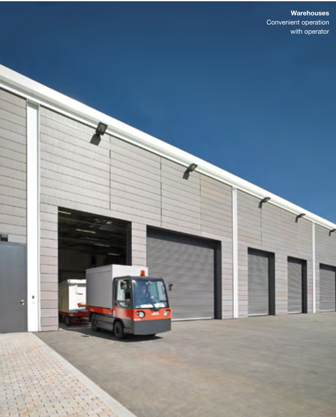
Warehouses Convenient operation with operator