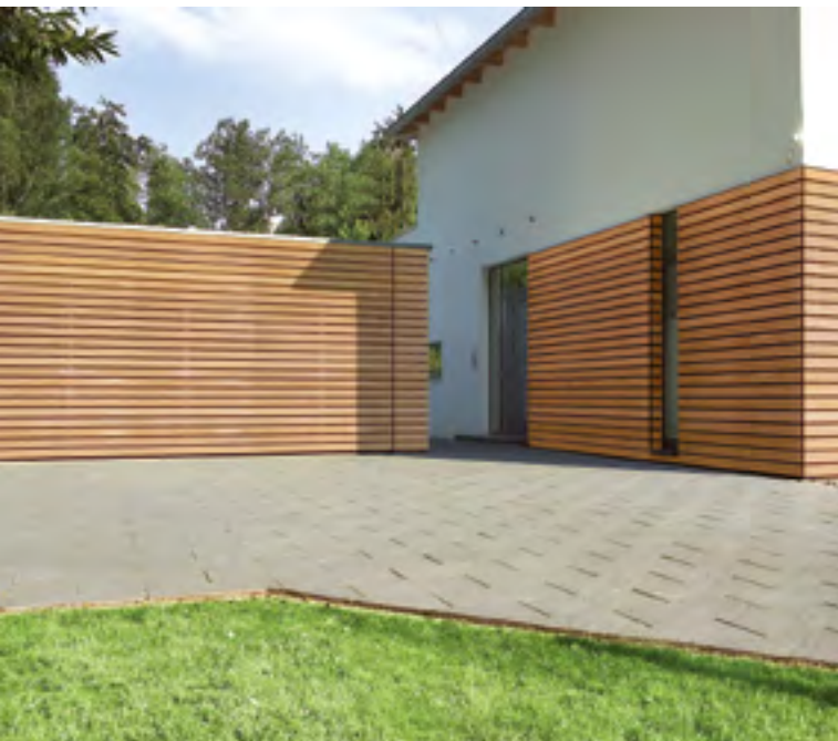
On-site cladding with timber panels