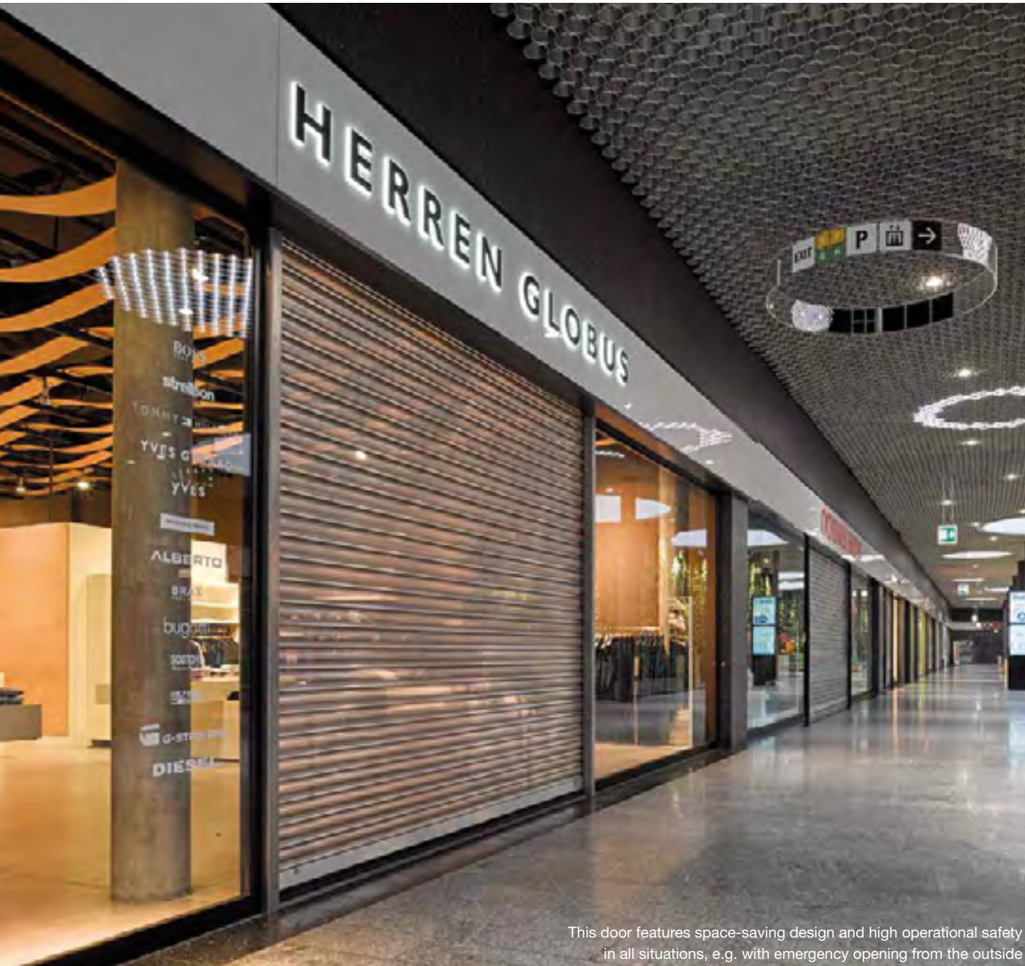
This door features space-saving design and high operational safety in all situations, e.g. with emergency opening from the outside