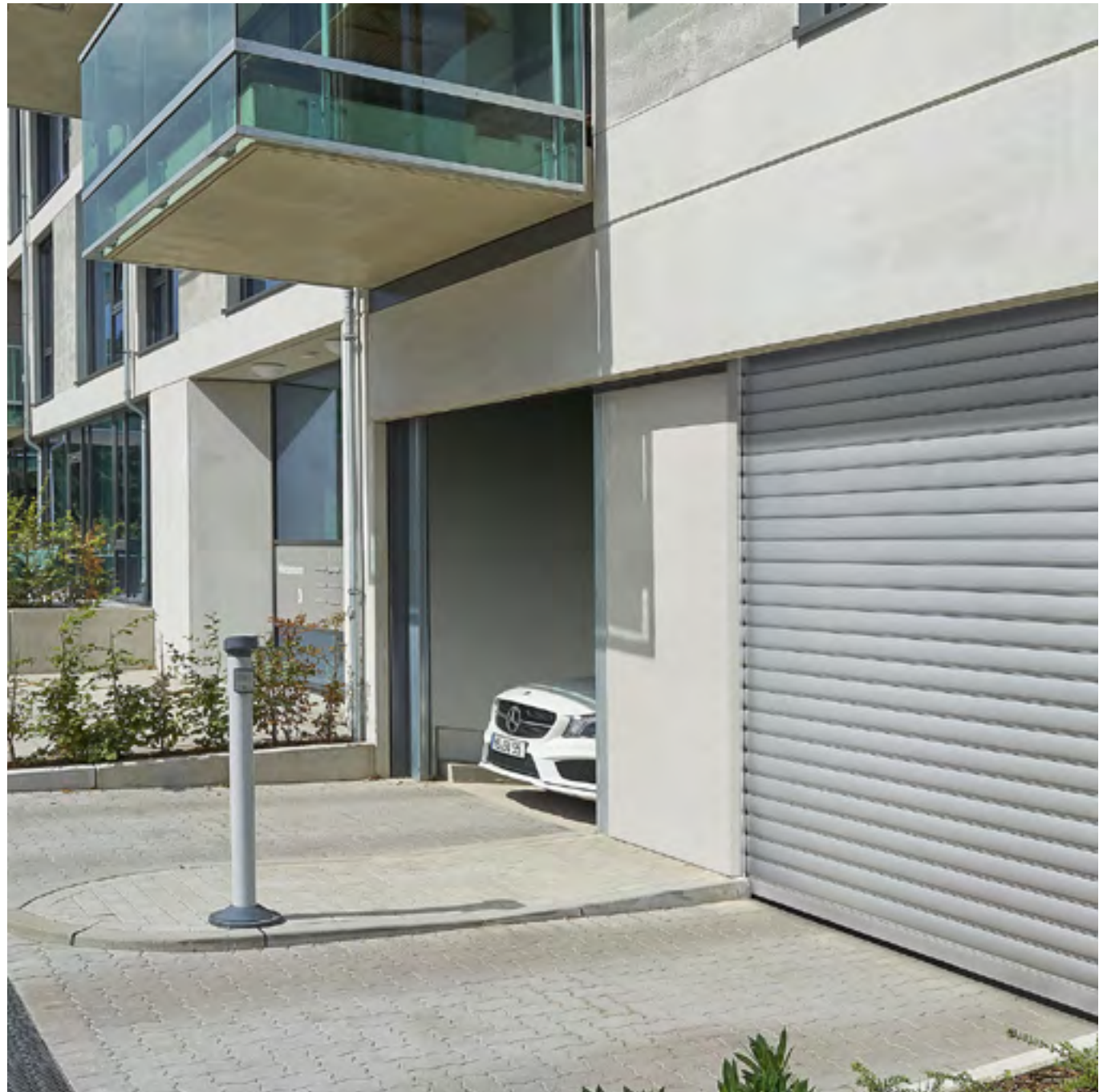
Residential and commercial building The compact construction is ideal for fitting situations with limited space

The door solution for collective garages with wear-free security technology